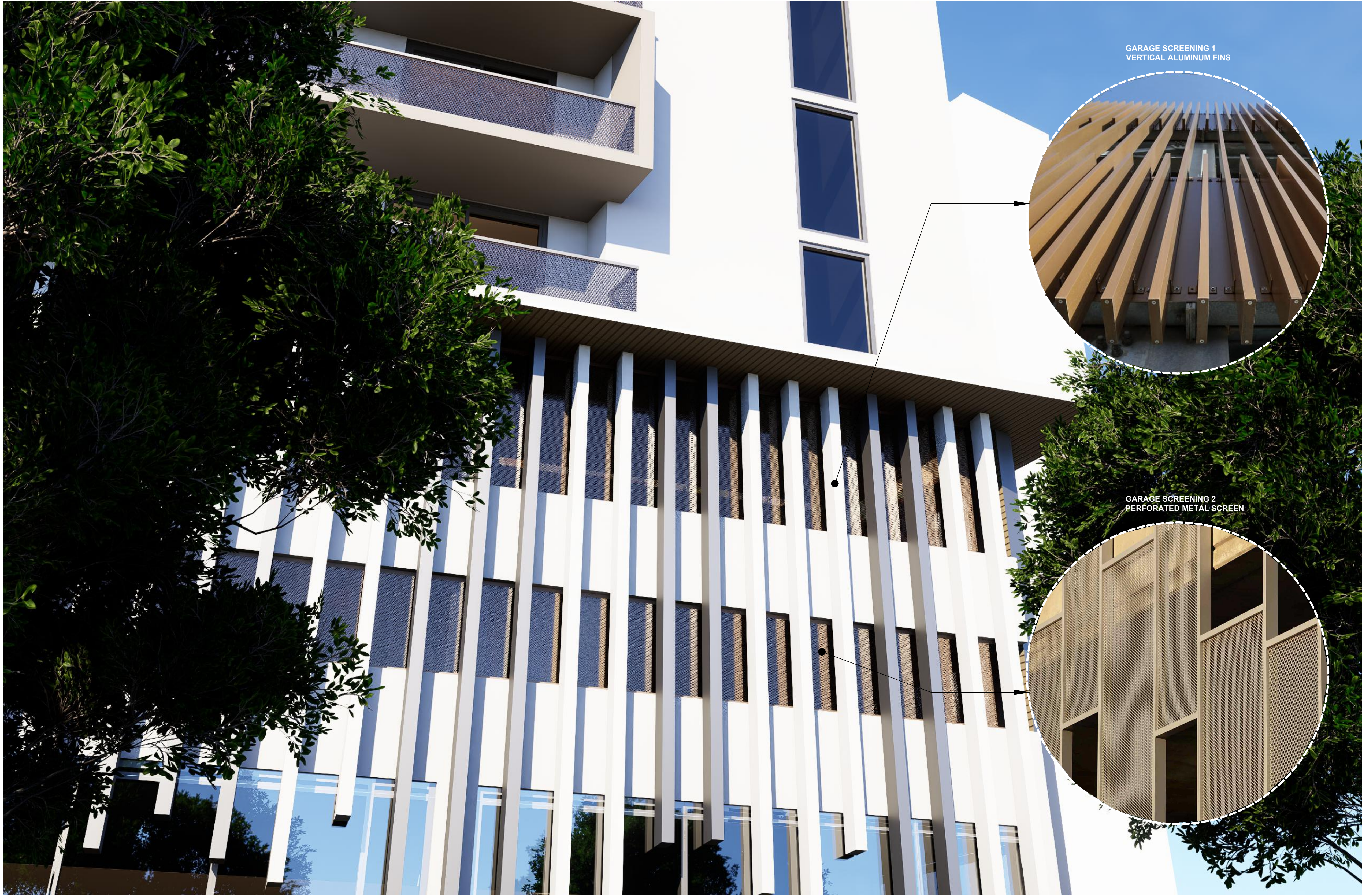
ZOOM-IN VIEW OF THE PARKING GARAGE SCREENING